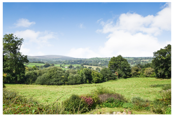
Apartment 6, Meldon Hall, Chagford, Devon, TQ13 8EJ £249,950 Share of Freehold